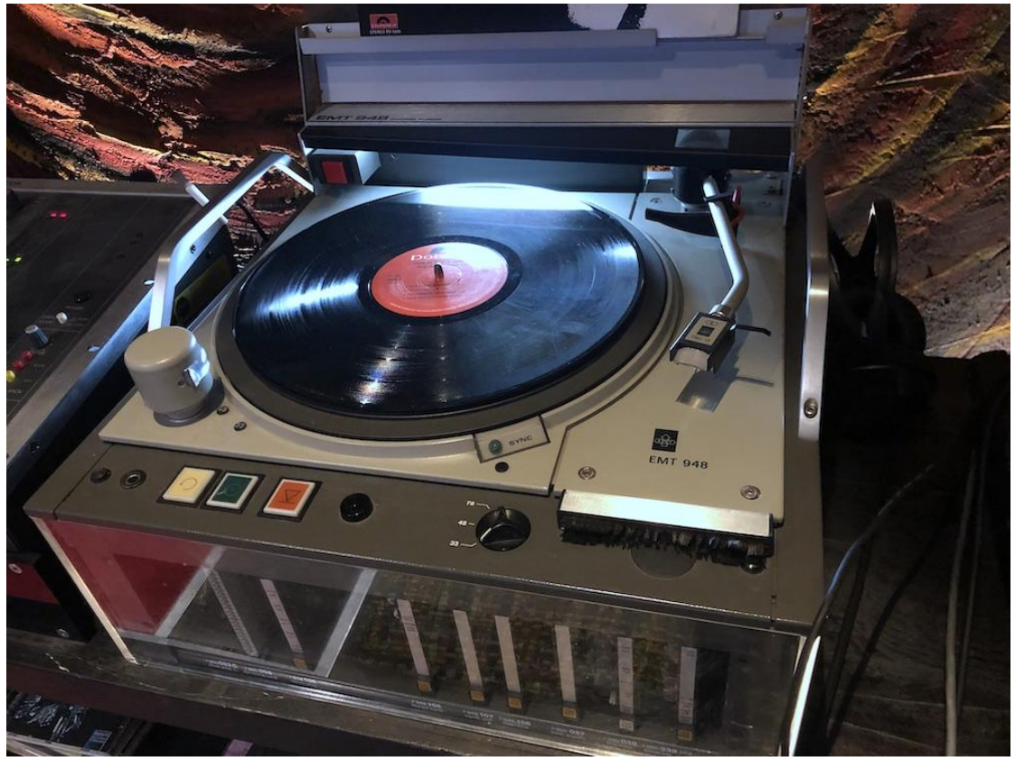
EMT 948 Turntable